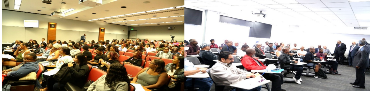
Single Mother Sessions

Theme: Dads Matter - Cultivating Future Fathers Youth & Law Enforcement, Classroom & Community Success, Manhood 101, Single Parent Rights, 24 Hour DAD, Both Parents Matter, Healthy Families, Legitimation